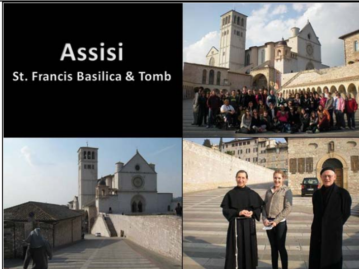
Assisi St. Francis Basilica & Tomb