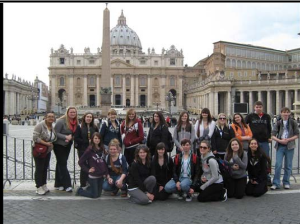
St. Stephen's Students at St. Peter's Basilica Vatican City March 2010