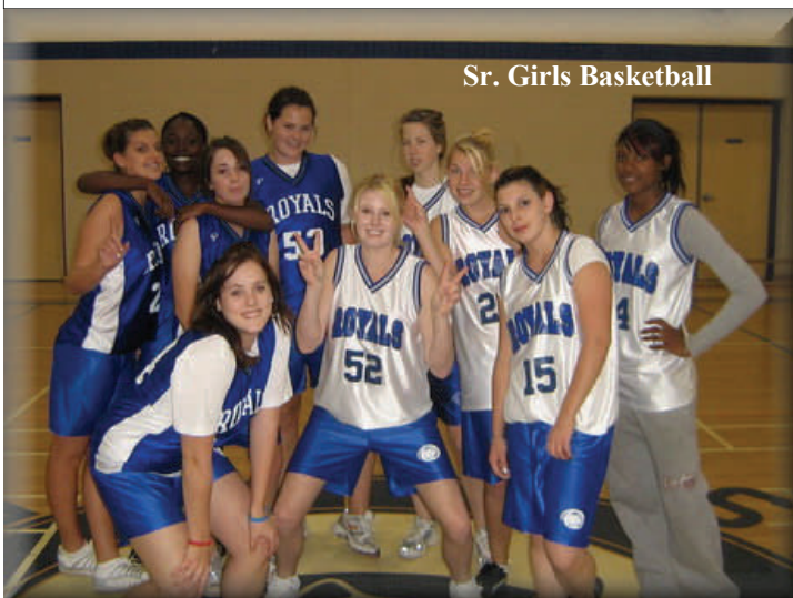
Sr. Girls Basketball