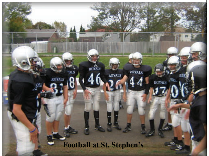
Football at St. Stephen's